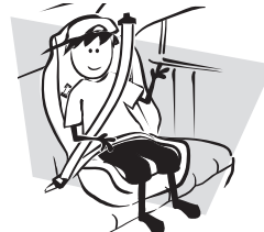
High back booster